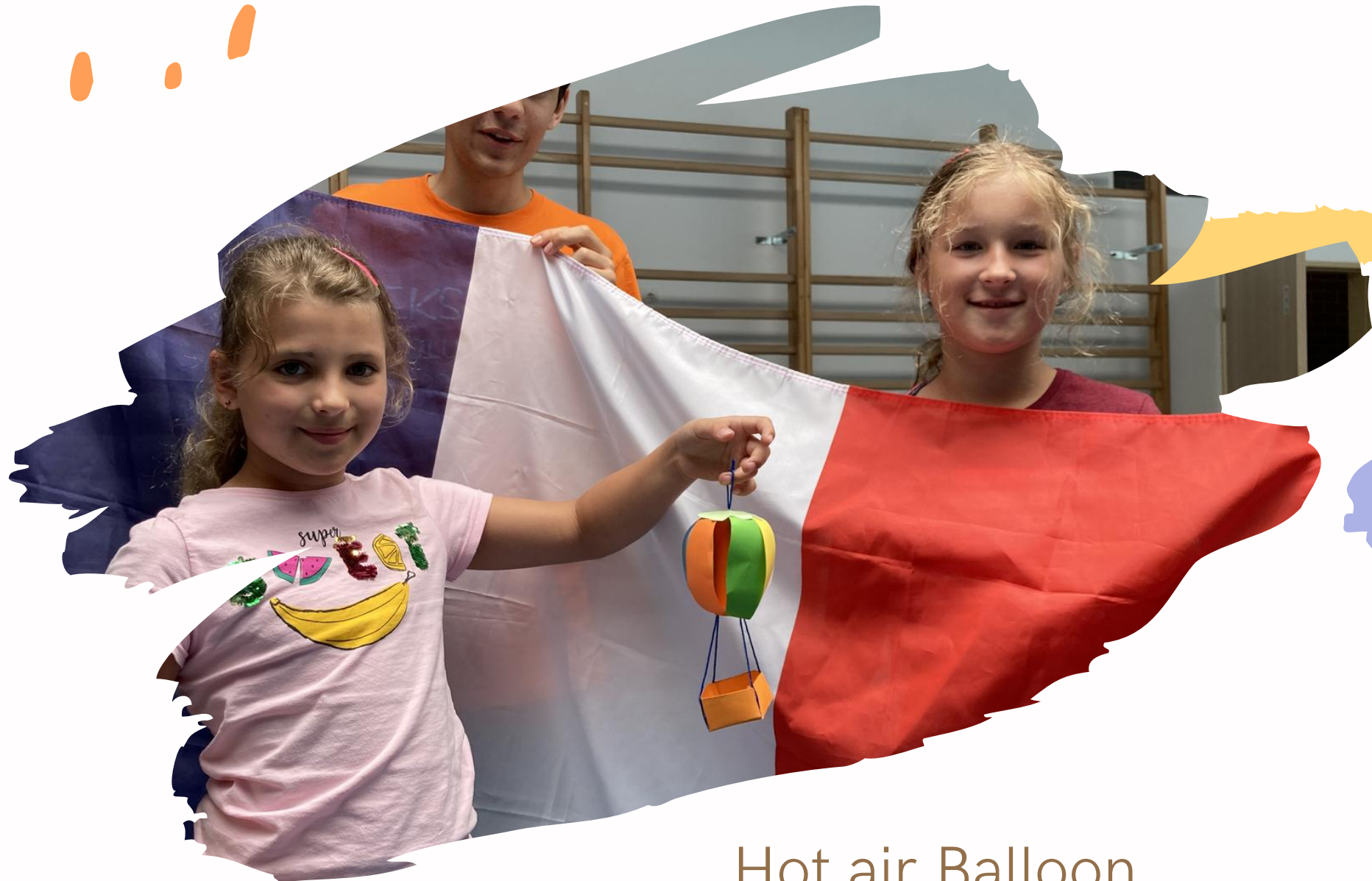
Hot air Balloon